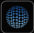
Link™ Capture Software